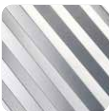
Ridged base (trivet)