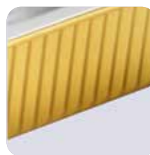
Fluted side wall