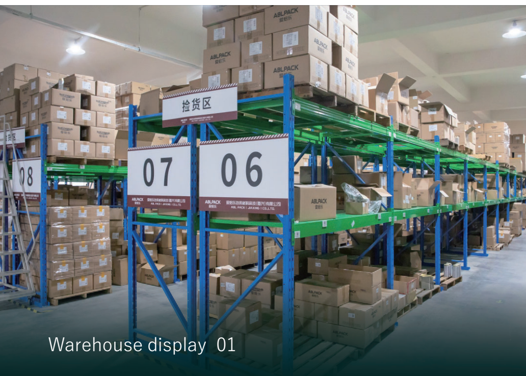
Warehouse display 01