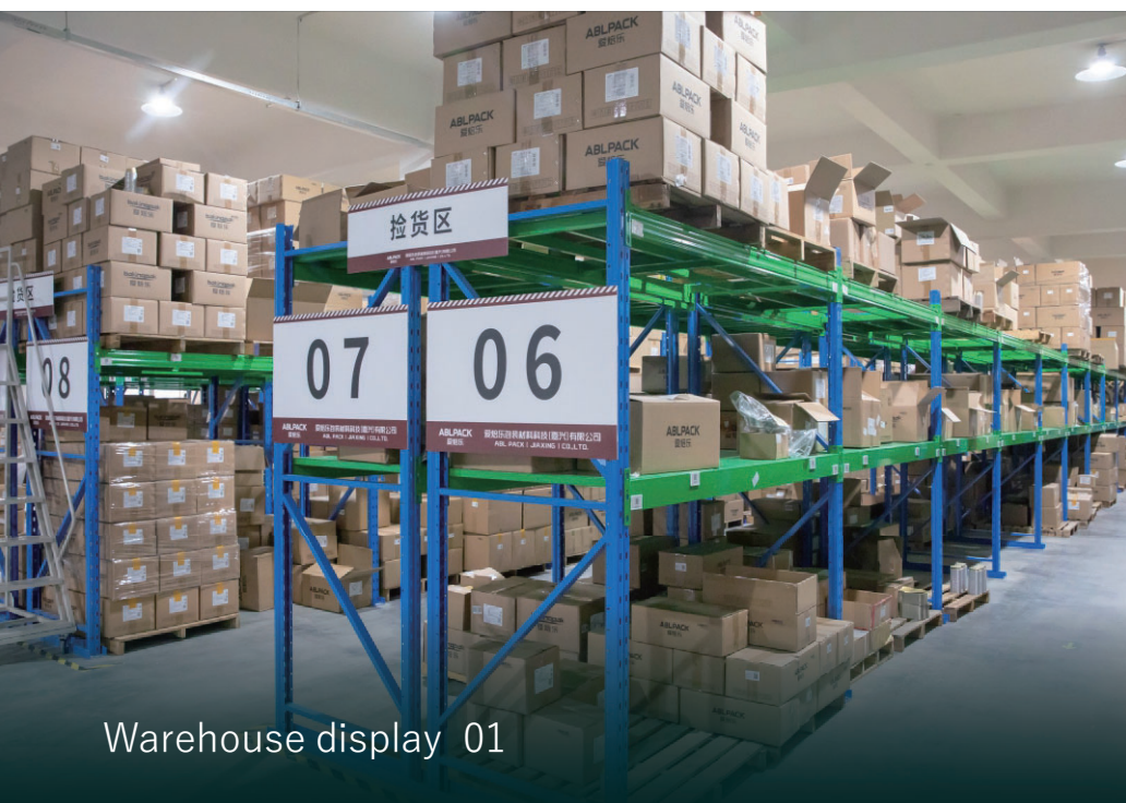
Warehouse display 01